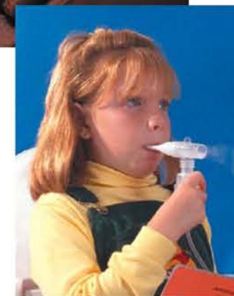
Children with respiratory diseases should be monitored closely during smoke alerts.